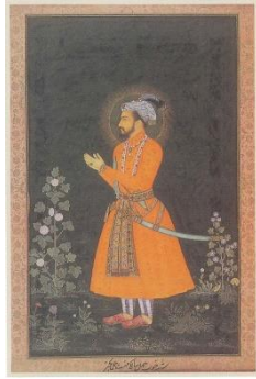
Figure 5: The Mughal emperor, Shah Jahan

Contemporary scholars specializing in art history have aimed to seek why the figure came to be rendered in profile from the ancient to the early modern period. Some appreciate this cliché to evoke the feeling of state and peace from Indian miniature painting, others condemn that it confines the pictorial expression into the formal and repetitive models. It is only certain that this phenomenon is one of the biggest enigmas in South Asian art. Now, we will analyze previous studies on the matter, depending on Khandalavala and Chandra (1969), and Wright (2008).