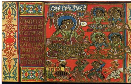
Figure 3: Trishala enjoying the dance performance.

In the early modern period, a profile is the most prevalent mode of representing the face in painting. Basically, the Early Rajput style, previously called the Chaurapancasika style, represents the figural face in complete profile in around the 16 th century (figure 4). Likewise, the manner is identical to Rajput painting in Hindu native states. In contrast, Mughal painting that maintains the Persian influence in the initial stage applies a three quarter face to the profane people. In the 17 th century, Mughal painting accepts a profile as a standard mode of the face (figure 5), which transition seems to be similar with that from the Jain style to the Early Rajput/Chaurapancasika style.