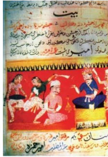
Figure 7: Hamzanama

However, the divine face maintains the traditional front view in the early modern miniatures in comparison with the profane people with a profile, partly because of its suitability to worship. As a result, the painters used a three quarter face in between the frontal and side views to the religious authorities, or siddha and divine entities such as goddess (figure 8) and Siva. It is assumed that a three quarter face enables us to perceive the figure as being more consecrated than a profile, which is less consecrated than a frontal view.