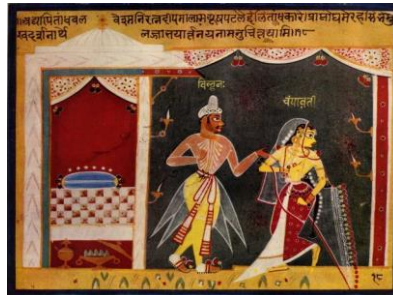
Figure 4: Birhana and Chanpavati in the room