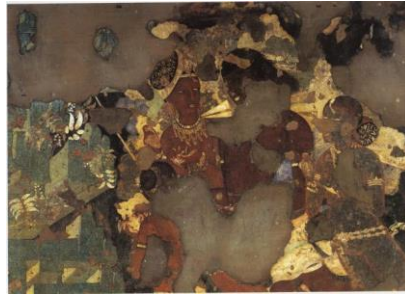
Figure 2: The heavenly beings

In the early modern period, a profile is the most prevalent mode of representing the face in painting. Basically, the Early Rajput style, previously called the Chaurapancasika style, represents the figural face in complete profile in around the 16 th century (figure 4). Likewise, the manner is identical to Rajput painting in Hindu native states. In contrast, Mughal painting that maintains the Persian influence in the initial stage applies a three quarter face to the profane people. In the 17 th century, Mughal painting accepts a profile as a standard mode of the face (figure 5), which transition seems to be similar with that from the Jain style to the Early Rajput/Chaurapancasika style.