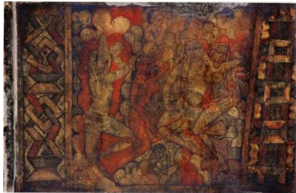
Figure 1: The heavenly beings

It is acknowledged that South Asian paintings are characterized by the facial mode in each period (Khandalavala and Chandra 1969). The Ajanta cave painting, the richest source in the ancient Indian art, dates from B.C. 1 to A.C. 5 century. It shows the Buddhist ascetics in frontal view, while other figures are depicted in three quarter face in which their eyes are contained in the line showing the outer edge (figure 1). Moving on to in the Ellora cave paintings executed between the 5 th and 7 th century, the eye in the far side is pushed out of the facial line in some figures (figure 2). These features are more obvious in the Jain manuscript paintings from the 14 th to the 15 th century (figure 3). In this final stage, even forehead confronts the observer beside the extended eye (Doshi, 1980).